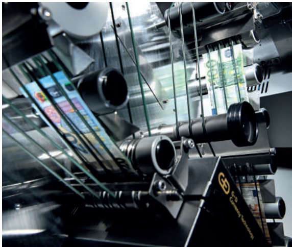
Top: The transport section is designed for high volumes and speed. The integrated NotaScan InOne Sensor provides all the security and reliability that commercial cash centers need to operate, and to fulfill central bank frameworks

All of our expertise in the development of high-end systems for central banks and high-volume cash centers has been poured into the BPS M3. We have now specifically tailored this technological advance to suit the needs of even more commercial cash centers